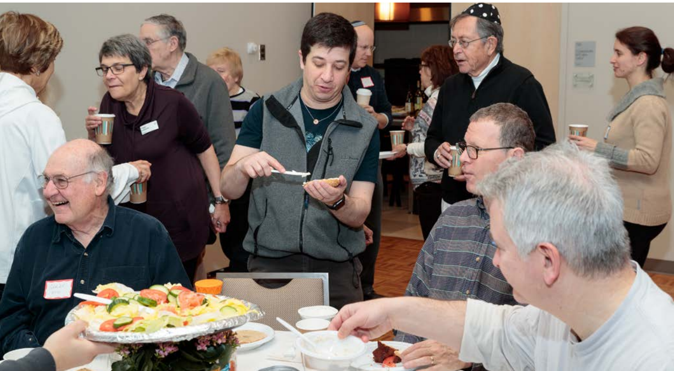
Left: a little shmear, a little kibbitz, maybe another shmear...

We get together with the other "arms" of TBS throughout the year to bring programming and events to the broader TBS community. Programs have included: guest speakers, learning opportunities, comedy nights, a Murder Mystery night, and much, much more.