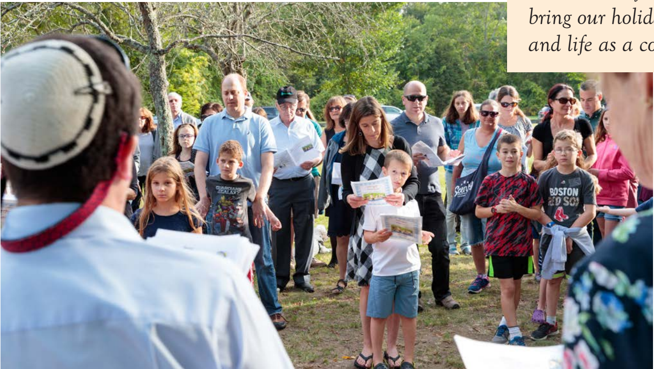
Left: celebrating Tashlich at Elm Bank.

Throughout the year we celebrate the vibrant rhythm of Jewish time. Please join us as we bring our holidays to light and life as a community.