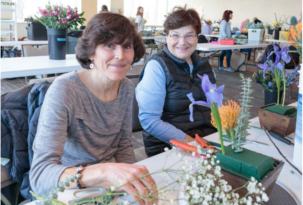
Above: Art in Bloom – after all the planning, now it's time to make the magic!

Annual Meeting & Dinner (Members Only) June 9, 2020 Location: TBA