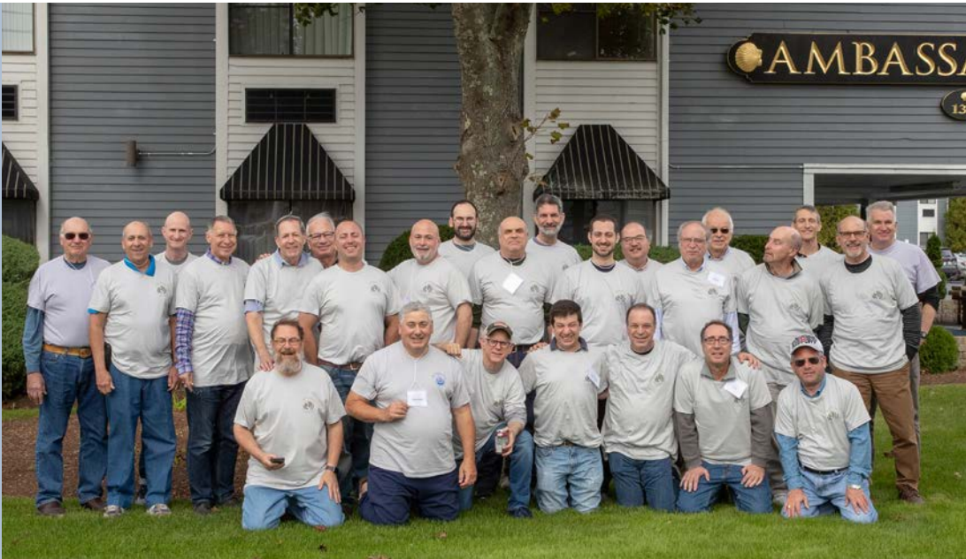
Above: the annual Brotherhood retreat on the Cape.

Come to one of our open planning meetings. We almost always meet on the second Tuesday of the month from September through June. Check the TBS calendar for details or drop us a quick note at: brotherhood@tbsneedham.org . If you want a new way to engage with the men of TBS, Brotherhood just might be for you. By the way...you can always drop by one of our Schmoozefests (see Events) to stick your toe in the water and meet some of the boys.