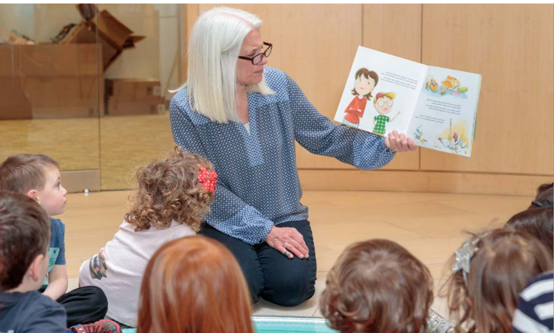
Left: Story Time