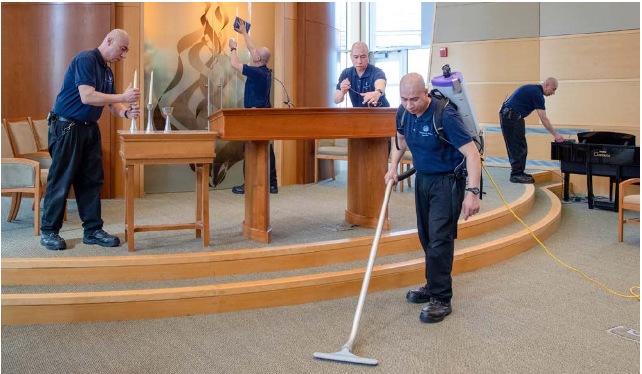
Above: Getting ready for tomorrow.