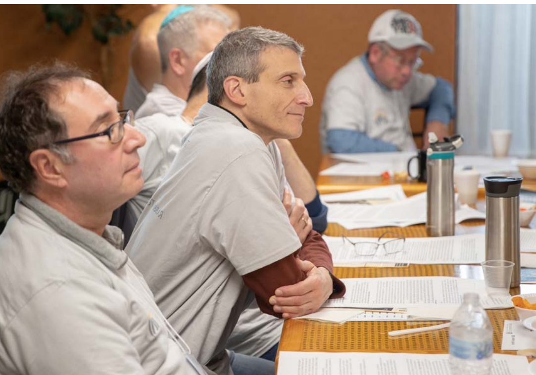
Left: Torah Study and discussion on the annual Brotherhood Retreat.