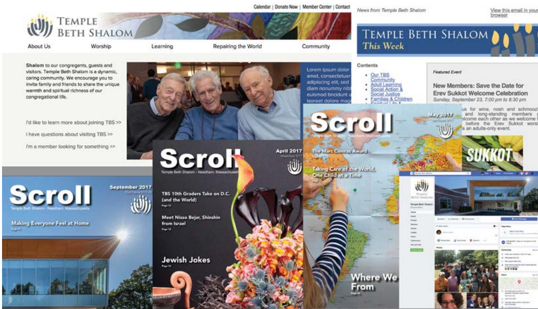
Above: examples of how we communicate...The Scroll, TBS This Week, www.tbsneedham.org , TBS on Facebook.

A Loss in Our Community You will receive an email when someone in our community has lost a loved one. Our clergy and Chesed Committee lead our congregation in supporting those who have suffered a loss.