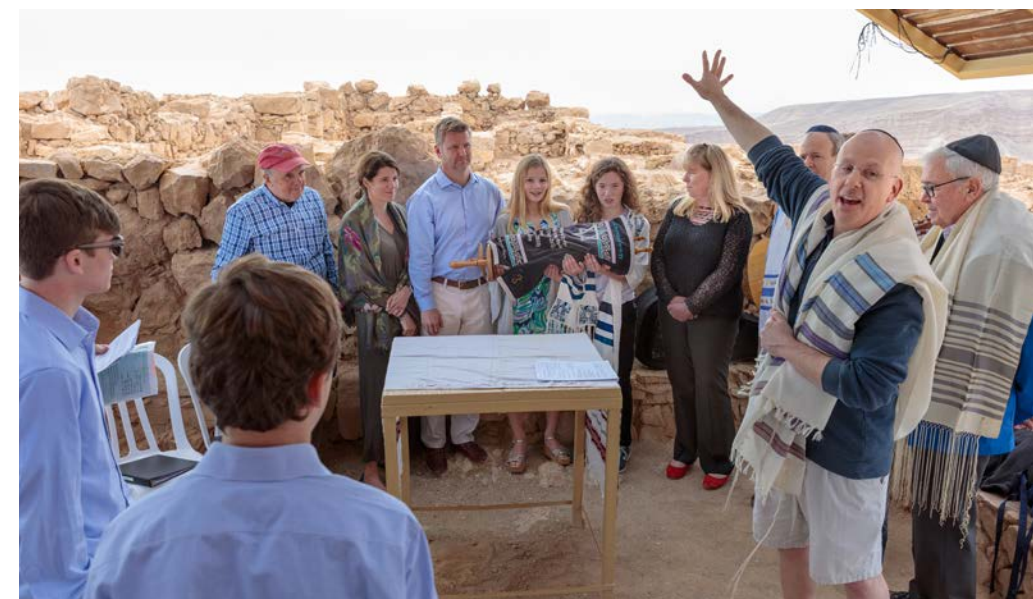
Above: some very special b'not mitvah atop Masada.