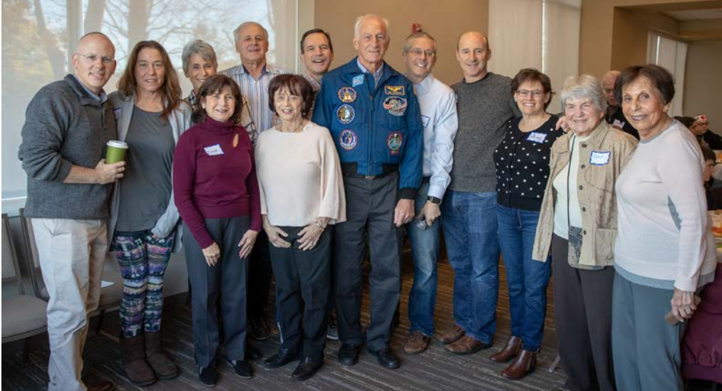
Above: Adult Learning Committee, joined by astronaut, Dr. Jeffrey Hoffman

Member Directory; this Community Guide, which provides a glimpse into all that goes on in the Temple community; and the High Holy Day brochure, with detailed information about the High Holy Days at TBS.