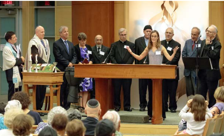
Below: Clergy from local houses of worship join TBS on Shabbat.

In the Torah, the Children of Israel were commanded “Tzedek, Tzedek, Tirdof” – “Justice, justice shall you pursue!” (Deuteronomy 16:20). When asked why the word “justice” is repeated, one sage replied: “This is to emphasize the importance of the mitzvah. We must promote justice for ourselves, for this reflects the kind of people that we aspire to be. And we must pursue justice for the sake of others!”