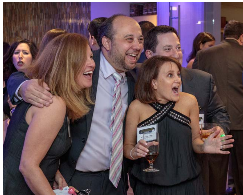
Above: 2019 L’Chaim Gala