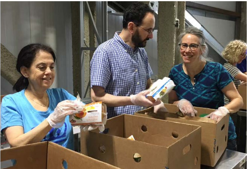
Left: sorting donations and stocking the pantry at the Boston Food Bank.