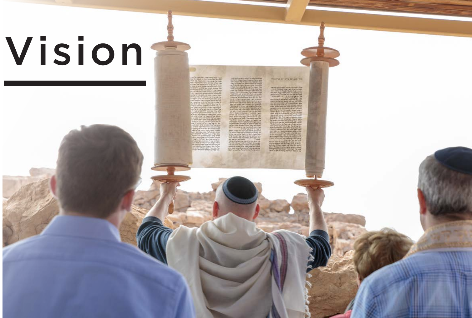
Above: celebrating with Torah atop Masada on the biennial TBS Israel trip.