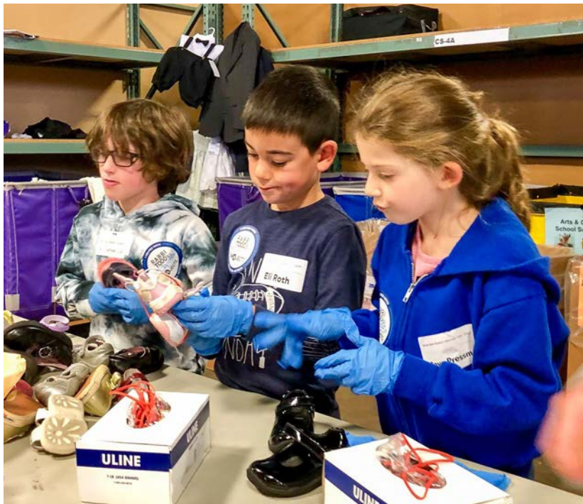
Below: packing materials for Cradles to Crayons.

Notes – “Circle of Hope” provides a GPS for volunteer drivers to borrow, if necessary.