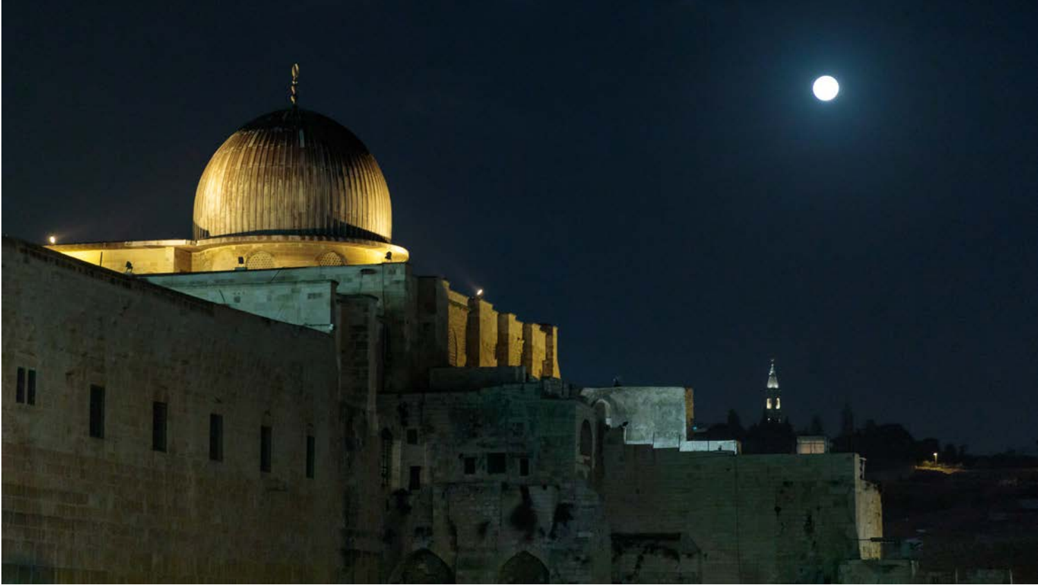
Above: The Dome of the Rock under a full moon, as seen by the TBS Israel Adventurers.

At the Direction of the Board, the Investment Committee provides oversight for the TBS Endowment Portfolios, as well as supports other investing activity. We do this to help ensure that the goals and financial objectives of the Temple are being met. TBS currently engages an outside investment adviser to handle the day to day management responsibilities of the Endowment portfolio. The Investment Committee interfaces with the outside manager and the Board, providing