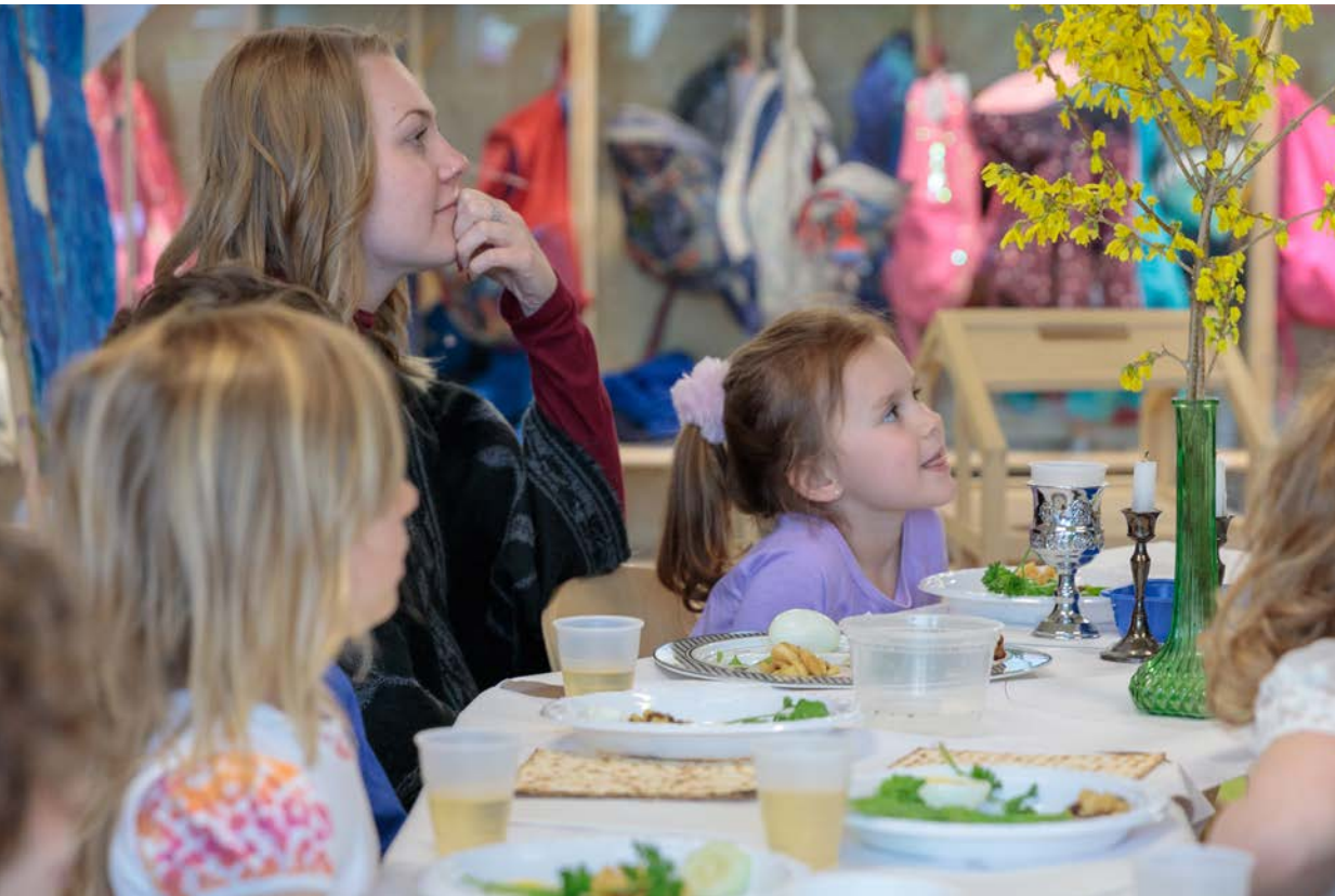
Above: Pesach in the Children's Center.